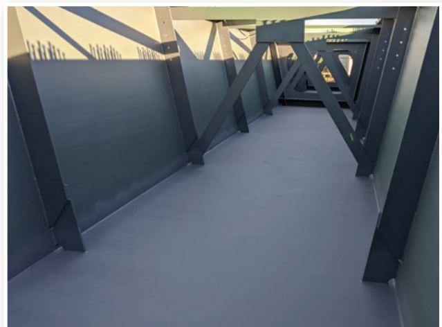
R2P Road Project - Bridge Girders “Finished inside - made from XLERPLATE® steel”