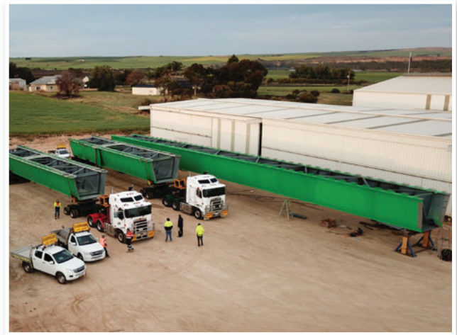
R2P Road Project - Bridge Girders “The first girder segments ready to leave the manufacturing site”